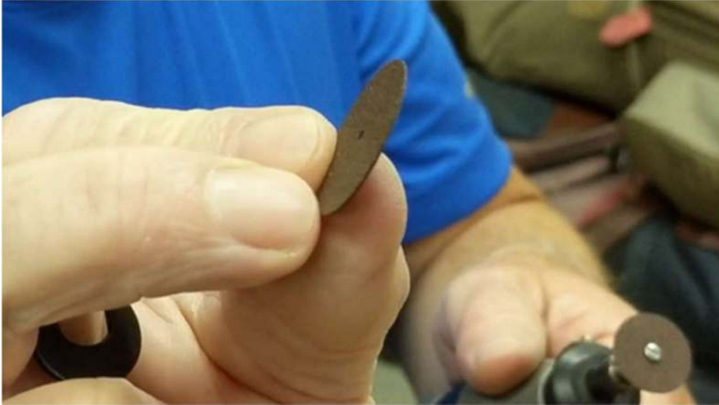
Thin cutout wheel.